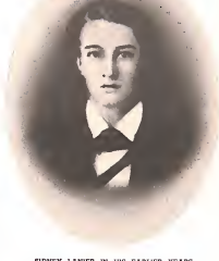
SIDNEY LANIER IN HIS EARLIER YEARS

through it all—a description of these distressing days may be found in his first and only novel, "Tiger Lilies"—Lanier dreamed his poems into being and made translations from Heine and Herder. Many of Lanier's fellow prisoners have written of the cheer and comfort he brought to their dismal, disease-laden surroundings during the hours he played upon his flute which he had smuggled into prison by hiding it up his sleeve. One of his improvisations was remembered by the young Virginian, John Ban-